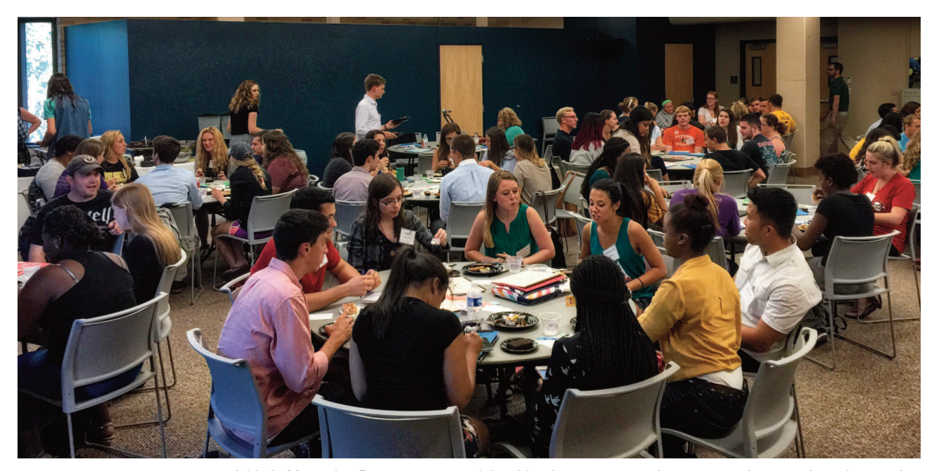
Athletic Mentoring Program mentors join with other mentors and tutors at an August orientation session