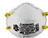
N95 filtering facepiece respirator

Voluntary respirator use of other types of tight-fitting respirators, such as half-face and full-face elastomeric respirators must be reviewed by EHS and will require medical clearance, training and fit testing.