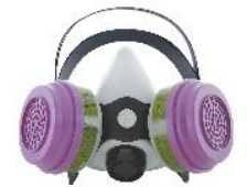
Half-face elastomeric respirator