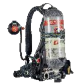
SCBA air tank

Atmosphere supplying respirators provide the user with breathing air from a source independent of the work area, such as an air tank.