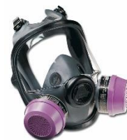
Full-face elastomeric respirator