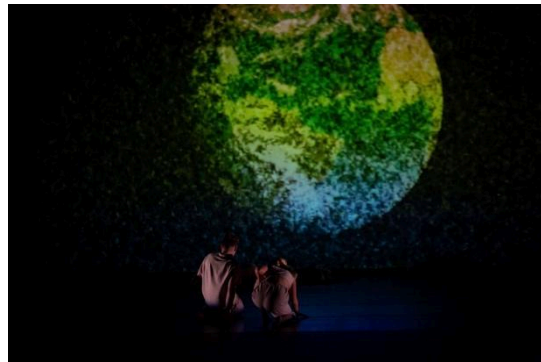
Photo: University Dance Company, Fall 2022

The American College Dance Association 's primary focus is to support and promote the wealth of talent and creativity that is prominent throughout college and university dance departments. ACDA's sponsorship of regional conferences and the national dance festival provides the venue for students and faculty to engage in three days of performances, workshops, panels, and master classes taught by instructors from around the region and country. The conferences also provide the unique opportunity for students and faculty to have their dance works adjudicated by a panel of nationally recognized dance professionals in an open and constructive forum. Culminating with the presentation of pieces selected for their exemplary artistic quality, the conferences are the primary means for college and university dance programs to perform outside their own academic setting and be exposed to the diversity of the national college dance world.