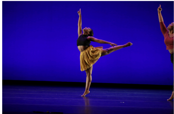
Photos: University Dance Company, 2022 & 2023