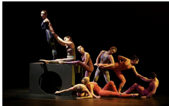
Photo: University Dance Company, 2022-2023 Season