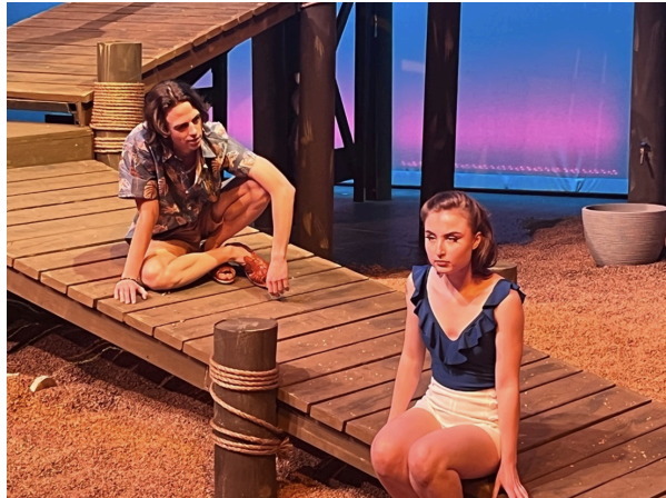
Eurydice, Fall 2022

Updated / Edited by: Juliet Wunsch / Departmental Faculty on 8/26/23.