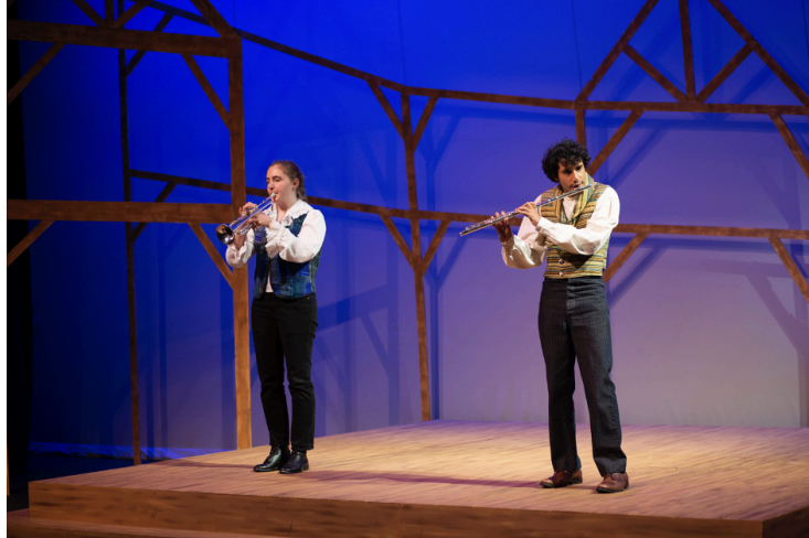
Twelfth Night, Spring '23